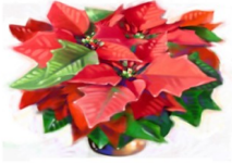
Order your Poinsettias

the deadline for the ordering of Poinsettias is November 25th at a cost of $9.25 per pot.